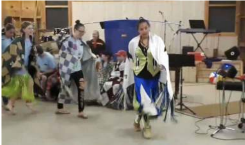
Fancy Shawl Dance

A young lady volunteered to dance in her regalia to celebrate the closing ceremonies. She led the girls in a Fancy Shawl Dance to a song by an Indigenous worship band.