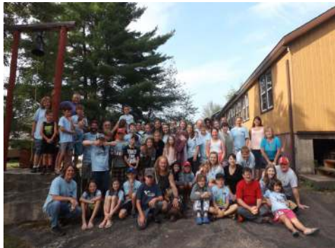
Pinaaz-i Zibi Maamawi Indigenous Camp

"Just as our bodies have many parts and each part has a special function, so it is with Christ's body. We are many parts of one body, and we all belong to each other." Romans 12: 4-5